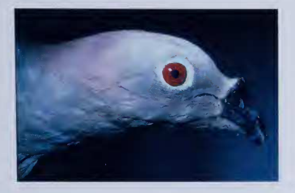
Figure 9 Spice Imperial Pigeon Ducula myristicivora.

eight). Mainly primary volcanic forest, disturbed volcanic forest, ultrabasic valley forest and tall beach vegetation; less frequently in kebun and mangrove forest. Mostly seen feeding in the canopy on fruits and berries. Often observed perched on high bare branches or in powerful direct flight above the forest. Voice a loud gutteral 'urwoow'.